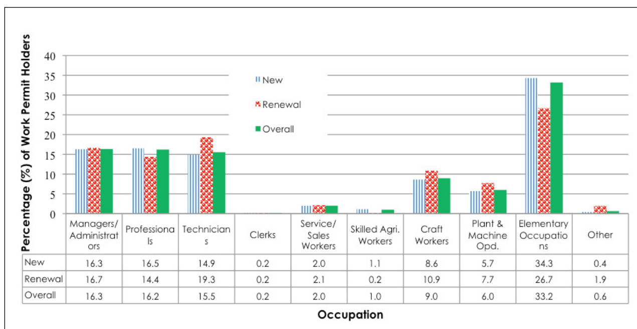
Figure 3: Percentage of New and Renewed Employees Work Permit Holders by Occupation - March 2014

Figure 3, Tables 1.4a and 1.4b show employee work permit holders (new or renewed), and their occupation. The largest proportion are found in the elementary occupations with 1,275 persons (33.2 percent), followed by the Managers/Administrators with 628 persons (16.3 percent) and Professionals with 623 persons (16.2 percent). The majority of work permit holders (88.1 percent) in the elementary occupations held new work permits.